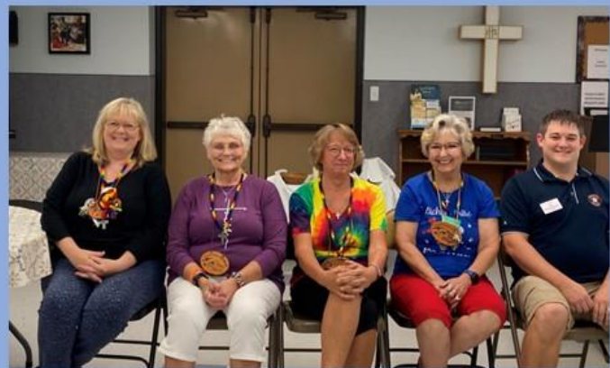
Walk Team Member Commissioning